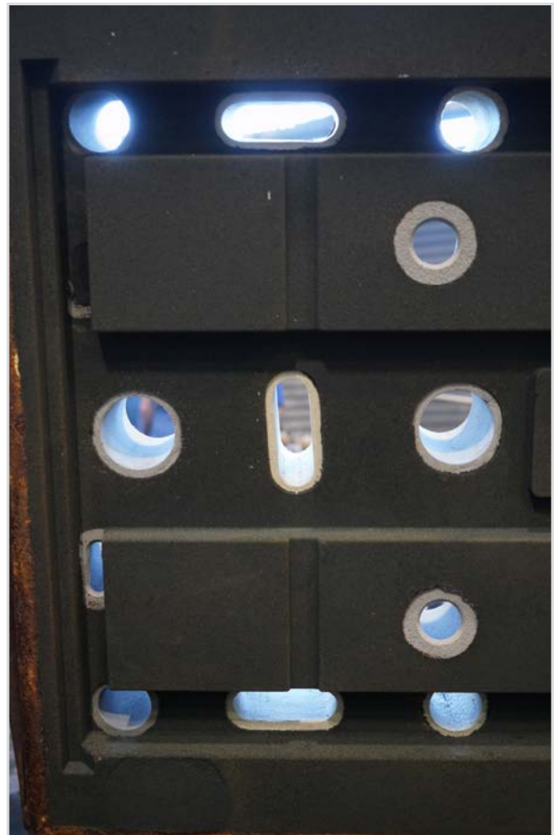
Figure. 2: Exothermic and insulating risers positioned in the moulding box

FEEDEX NF1 is a new recipe for the non-ferrous sector. The fast, steady and lasting reaction makes it an excellent alternative to conventional insulating feeders. The high strength of the risers makes them suitable for use on automated moulding lines. The improved feeding effect can lead to a reduction of the feeder size and thus to a saving of recycled material. The manual addition of blowhole powders is no longer necessary, which increases process stability.