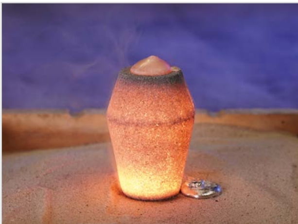
Figure 4. Constant burn-off of the FEEDEX NF1 feeder