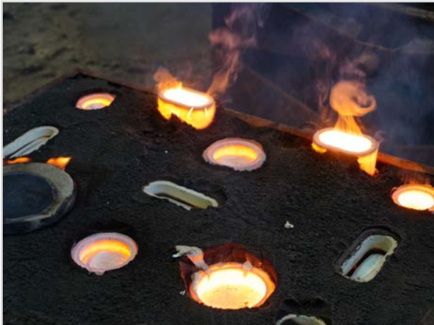
Figure 3: Clearly visible exothermic reaction of the FEEDEX NF1 riser

Figure 3 shows the FEEDEX NF1 risers during casting. The exothermic reaction is clearly visible in contrast to the insulating risers. The reaction starts only a few seconds after filling with the melt and continues slowly and evenly. This makes the addition of exothermic powders such as FEEDOL* obsolete.